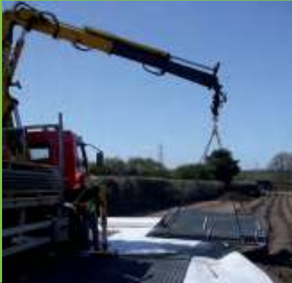
Depicts low profile traction surface