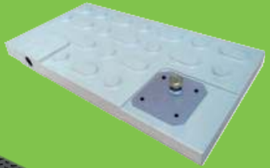
TuffTrak® bracket and lifting lug

TuffTrak® is fast to install with a simple 'drop in' bolt system.